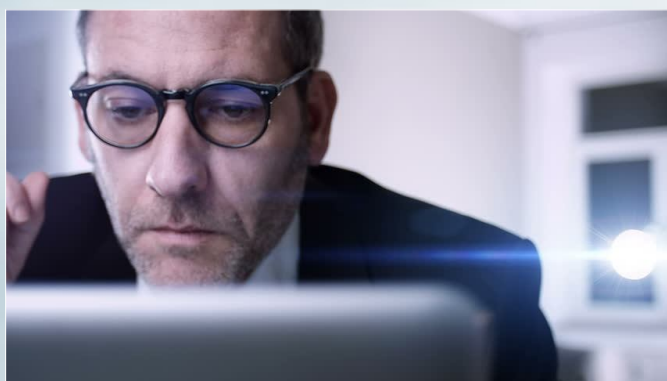
Speech Recognition designed for professional users